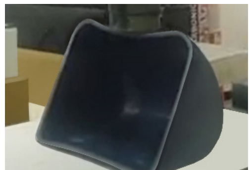
The effect of compression where the high flexibility of the Metcan bucket can be observed as it returns to its original shape.